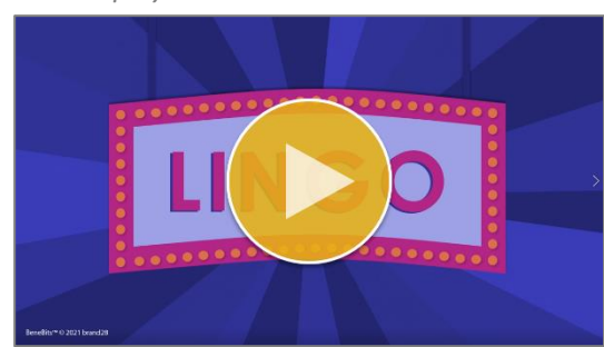
Click to play video

Can you beat the Health Lingo game? Learn the words that will help you understand how your plan works.