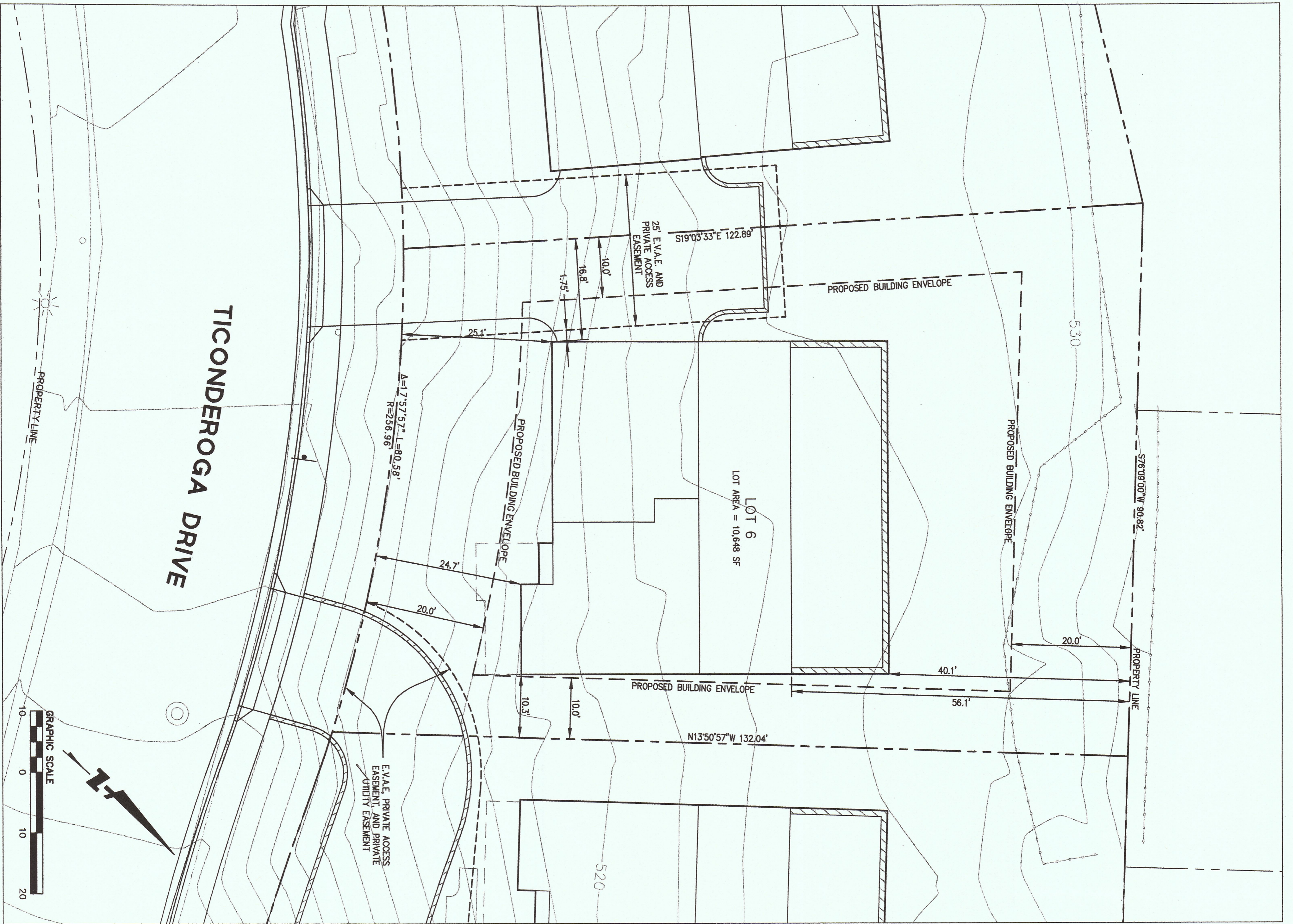
LOT 6 SITE PLAN SCALE: 1"=10'